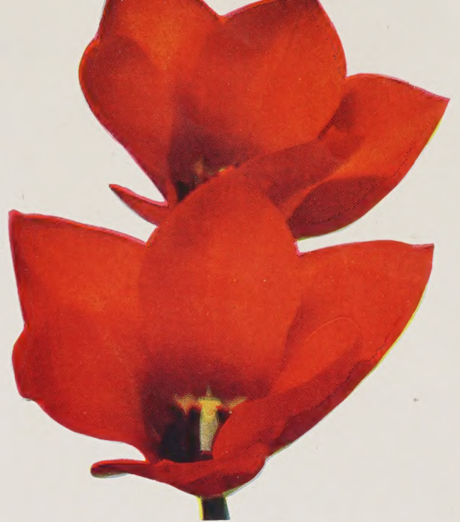
FOSTERIANA RED EMPEROR (SPECIE)

FOSTERIANA RED EMPEROR (Early) 18". Brilliant scarlet flowers of enormous size. The black and gold base heightens the effect. Outer petals are turned back at the tips, producing a novel character in the flower. 3 for 45c, 12 for $1.60